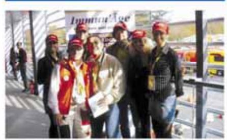
With Immun'Age Ferrari race queens