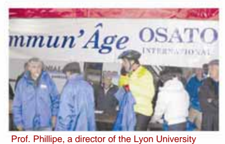
Hospital also joined the race

fired the starter's gun. Osato International donated all the proceeds from this charity race to the Childhood Cancer Center at Lyon University. Osato International will continue to make contributions to society through such charitable activities.