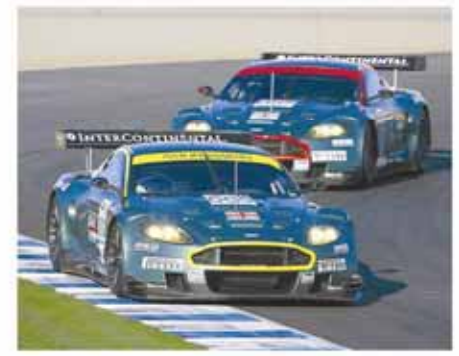
DBR9 & DBR7

and sports activity. We hope that the results of our clinical tests will contribute to the drivers' increased safety in upcoming races.